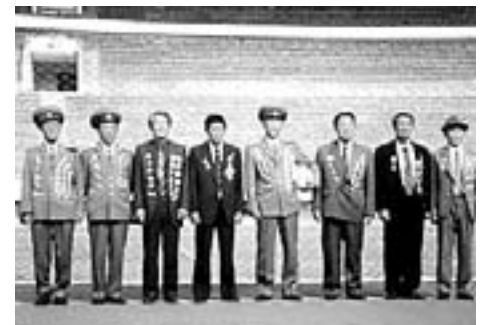
The eight surviving members of the 1966 North Korean Football Team

struggle, success, surprise and football transcending political and cultural boundaries.