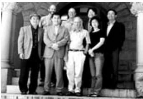
June 7, 2003 meeting of ASCK steering committee at Stanford University

ASCK believes that current problems on the Korean peninsula and between US and the two Koreas can only be solved through dialogue, cooperation, and the active pursuit of peace. ASCK feels the responsibility to speak out against policies that increase tensions in Northeast Asia and may lead to another catastrophic war in Korea. ASCK wishes to add its voice to a constructive discussion on how to achieve a peaceful, unified Korea existing in harmony with its neighbors, including the United States. To learn more about ASCK, go to www.asck.org .