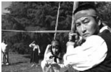
YMCA Baseball Team

Set between 1905 and 1906, when Chosŏn-era Korea was undergoing a transition with the arrival of Western modernity as well as Japanese imperial forces, this popular sports comedy offers a rare, ethnographic look at turn-of-century Hwangŏng (Seoul). Assisted by a "New Woman" named Min Chŏng-rim, American missionaries teach Koreans how to play baseball, in the process turning a ragtag group of men from different social affiliations (scholars, offspring of the ruling-class, peasants, peddlers) into a unified team called YMCA—the first in Korean history. By the end, our unlikely heroes emerge as a symbol of hope for Korea, even as the nation was facing Japanese annexation.