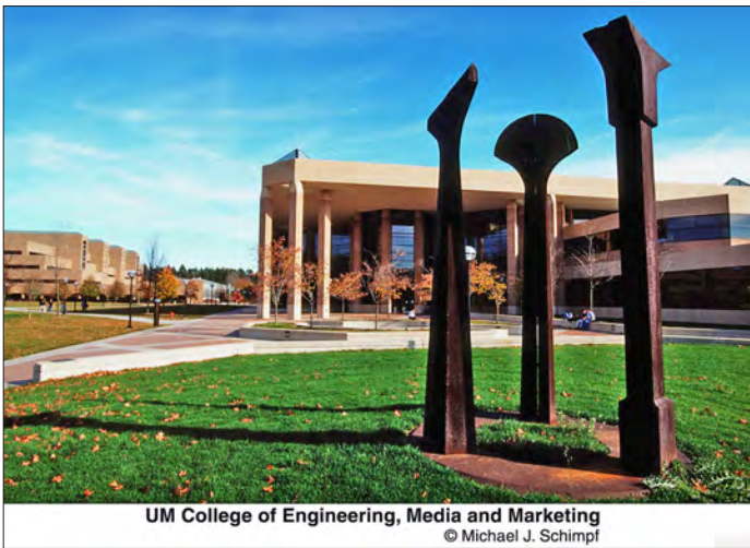
UM College of Engineering, Media and Marketing