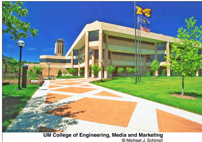
UM College of Engineering, Media and Marketing