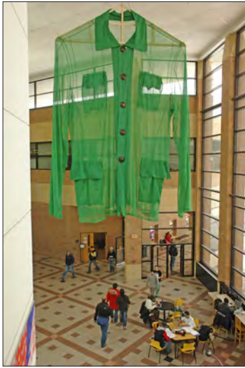
Art at the Dude_2008 06 Spring Scenes (7)