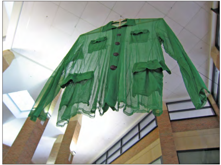
Art at the Dude_IMG_0941