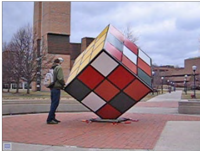
Art at the Dude_MVI_1007