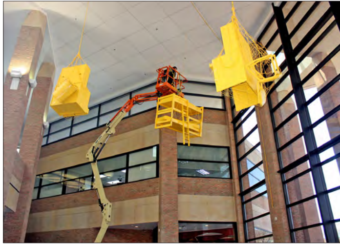
Art at the Dude_IMG_5681