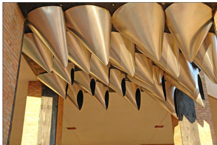
Art at the Dude_2013 11 DC Art Disaster (8)