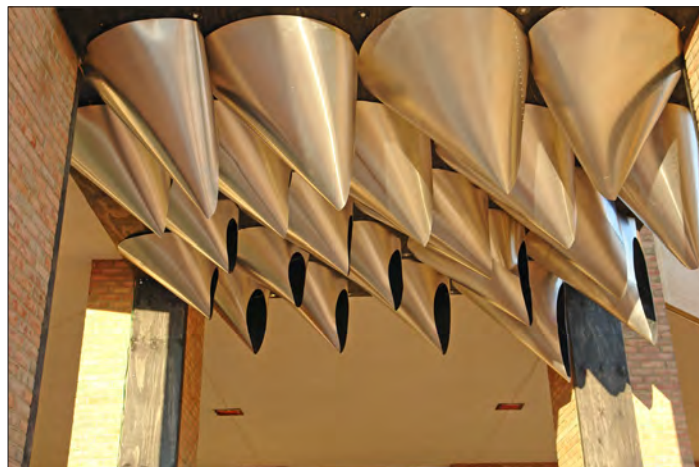
Art at the Dude_2008 26 Art and Environment (8)