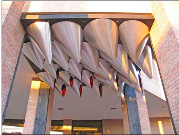
Art at the Dude_IMG_1964