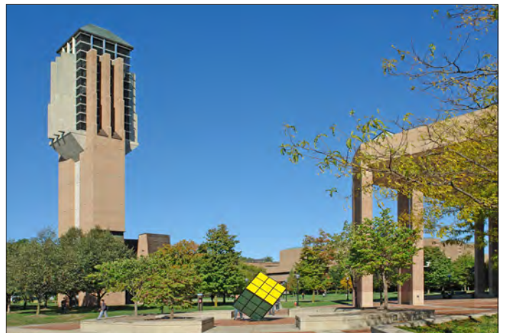
Art at the Dude_2008 26 North Campus Fall Scenes (3)