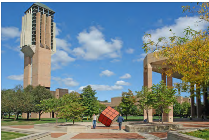
Art at the Dude_2008 29 CAEN 25th Anniversary (38)